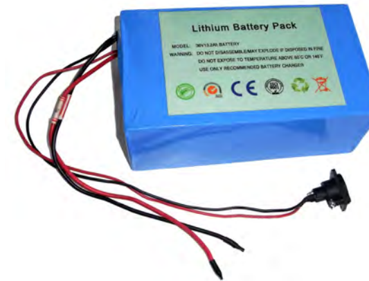
36V Lithium Battery Block