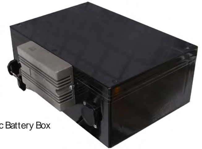
Tough Plastic Battery Box