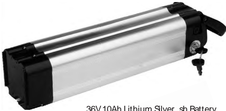
36V 10Ah Lithium Silver fish Battery